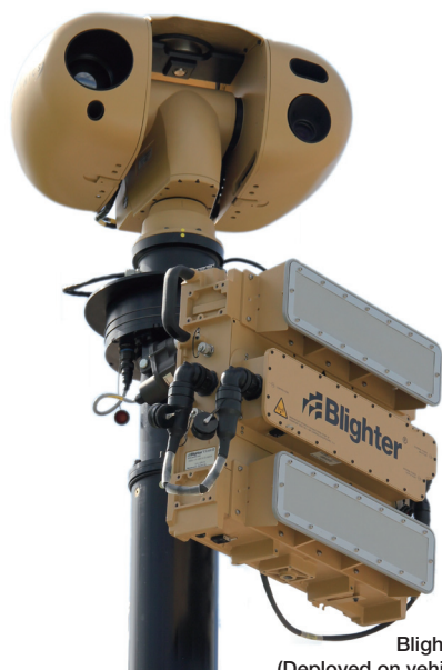
Blighter Scout (Deployed on vehicle mast)