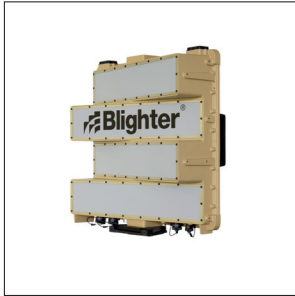
Blighter B202 Mk 2 Radar (80° or 90° azimuth scan angle)