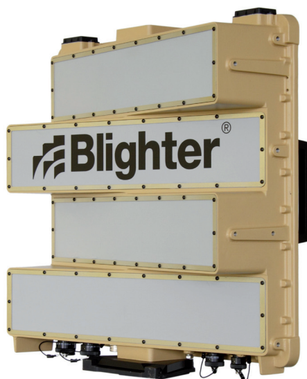
Blighter B202 Mk 2 Radar (80° or 90° azimuth scan angle)